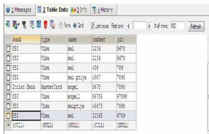
Fig 1: Database maintains the uploaded information of the editor