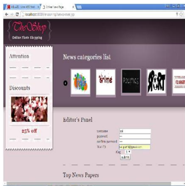
Fig 2: Editor Registration

The editor who wants to upload the wiki leaks information should be registered with a valid mail ID